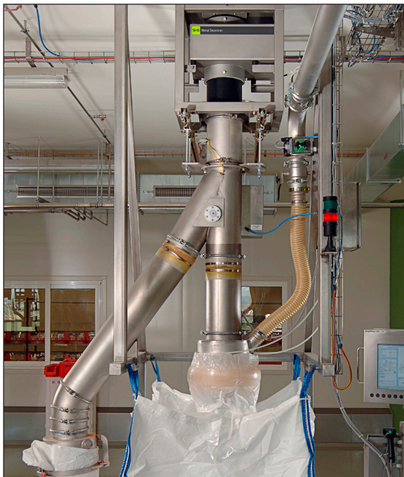
Installation example: IFS compliant metal detection directly before the filling of spice products into bigbags. (old version)